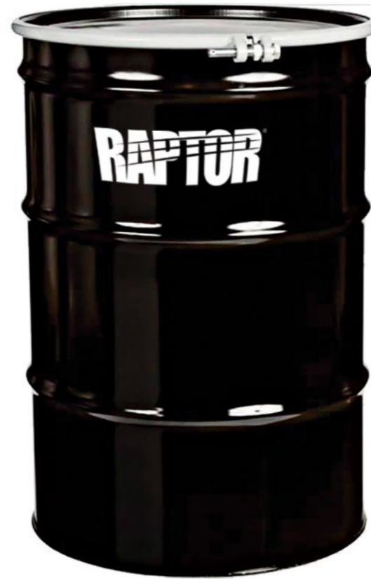
200 Liter Drums

Raptor packaged for high volume users and point of use application