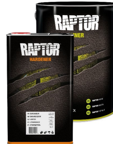
20 Liter / 5.28 GI Kit