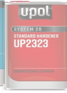
Clears and Primers