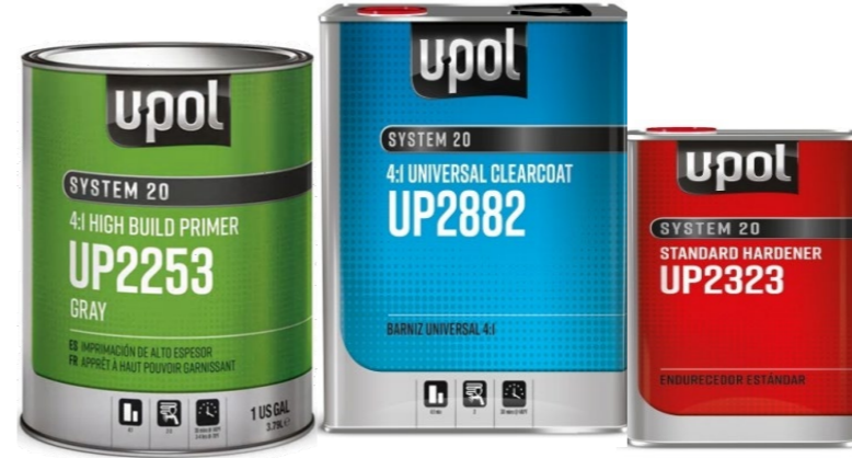
Clears and Primers